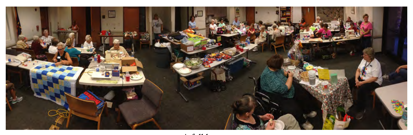
A full house.